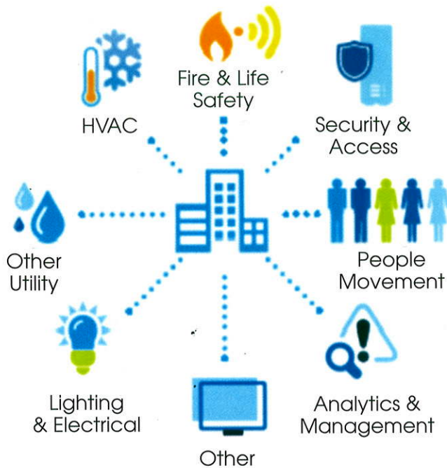
Figure 2: IoT

are able to provide enhanced facilities asset tracking and utilisation, better performance reporting via balanced scorecards or personalised dashboards using cloud technology, and to maximise the useful life of smart facilities through redeployment.